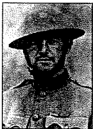
GEN. WILLIAM J. "WILD BILL" DONOVAN, USA CLASS OF 1903